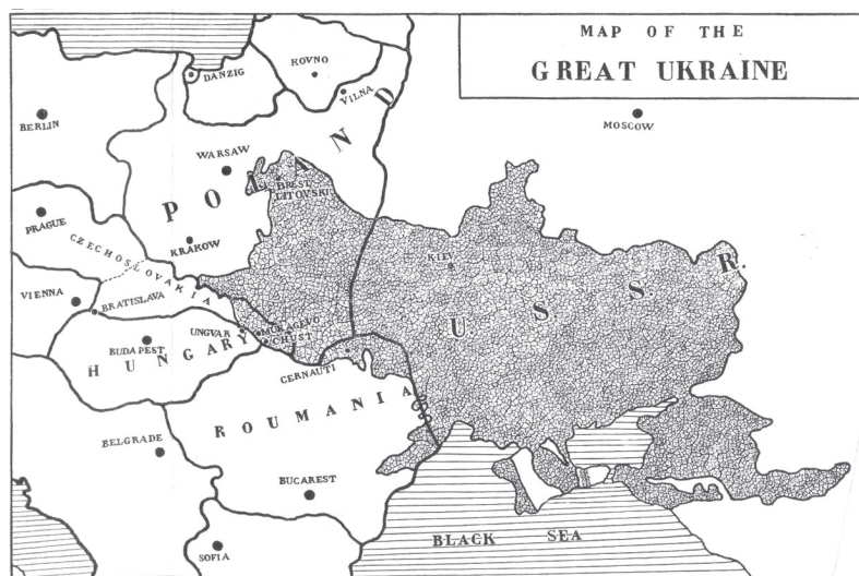
Map of Greater Ukraine in Winch's book.

which wanted to annex the territory. On November 26 a Ukrainophile administration headed by Monsignor Avhustyn Voloshyn (Augustin Volosin), a Catholic priest, was installed. Three weeks after an arbitration in Vienna, Hungary obtained the most economically developed area in the south including the capital Uzhhorod. The capital was moved to Khust. The state was invaded by Hungary on 14 March 1939.